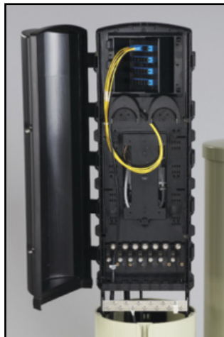
Drop Side of 10” Fiber Organizer