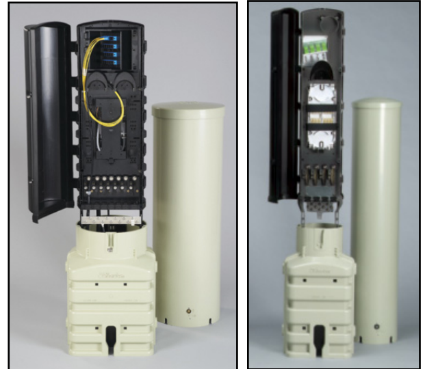
10” (left) and 6” (right) CFDP Interconnect Pedestals

CFDP Pedestals offer two-stage environmental protection of fiber distribution points. This two-stage protection is accomplished by housing a weather-tight interior enclosure within the confines of a non-metallic buried distribution pedestal. Together, this “enclosure within an enclosure” combination is designed to exceed Telcordia GR-771-CORE specifications and provide an unbeatable line of defense against the elements, including floods, fire, dirt, debris, insects, and corrosion.