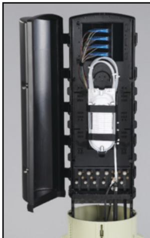
Central Office Side of 10” Fiber Organizer