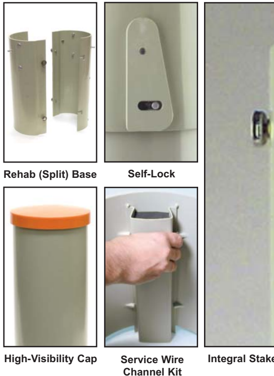
Rehab (Split) Base