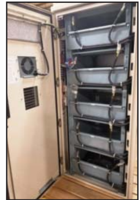
CUBE-BB48E2EV1 Front Door Open