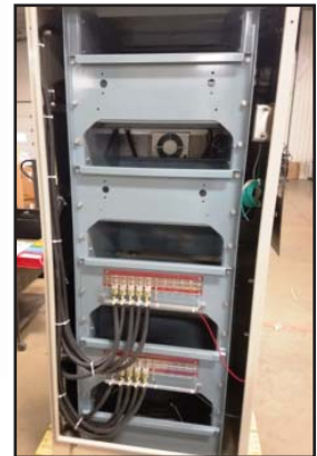
CUBE-BB48E2EV1 Back Panel Removed